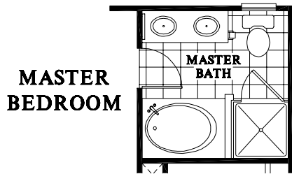
OPT. OVAL TUB WITH SEPARATE SHOWER AT MASTER BATH